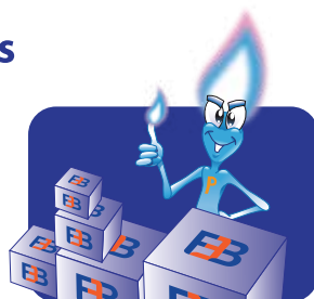
Treatment of folder-gluer lines