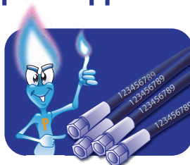
Treatment of electric and special cables